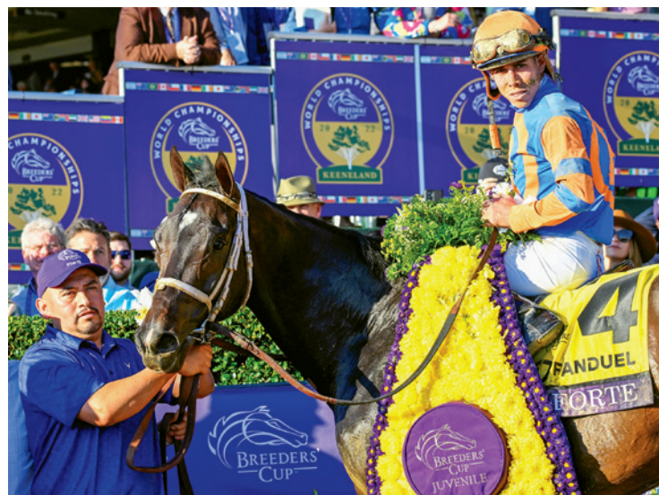
Although Eclipse Awards were to be announced after publication of this issue, Forte figures to be named champion juvenile male off his victory in the Breeders' Cup Juvenile

was a Mastery colt out of Rose to Fame, a broodmare that was sold in November.