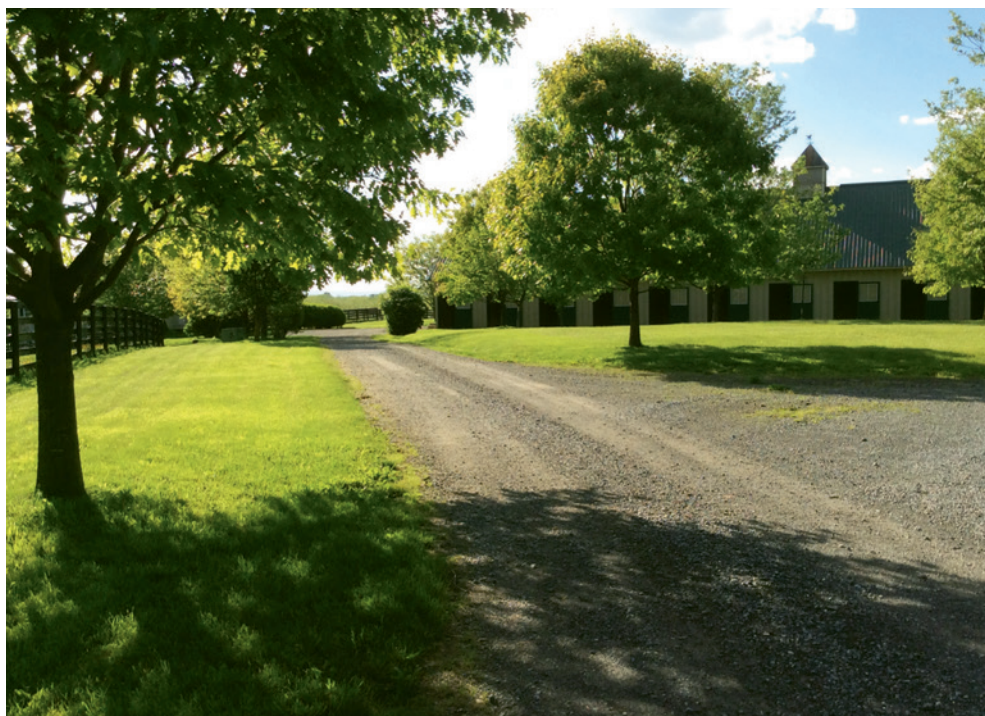
Moore believes Virginia's strong outlook should spark interest in boarding at South Gate Farm