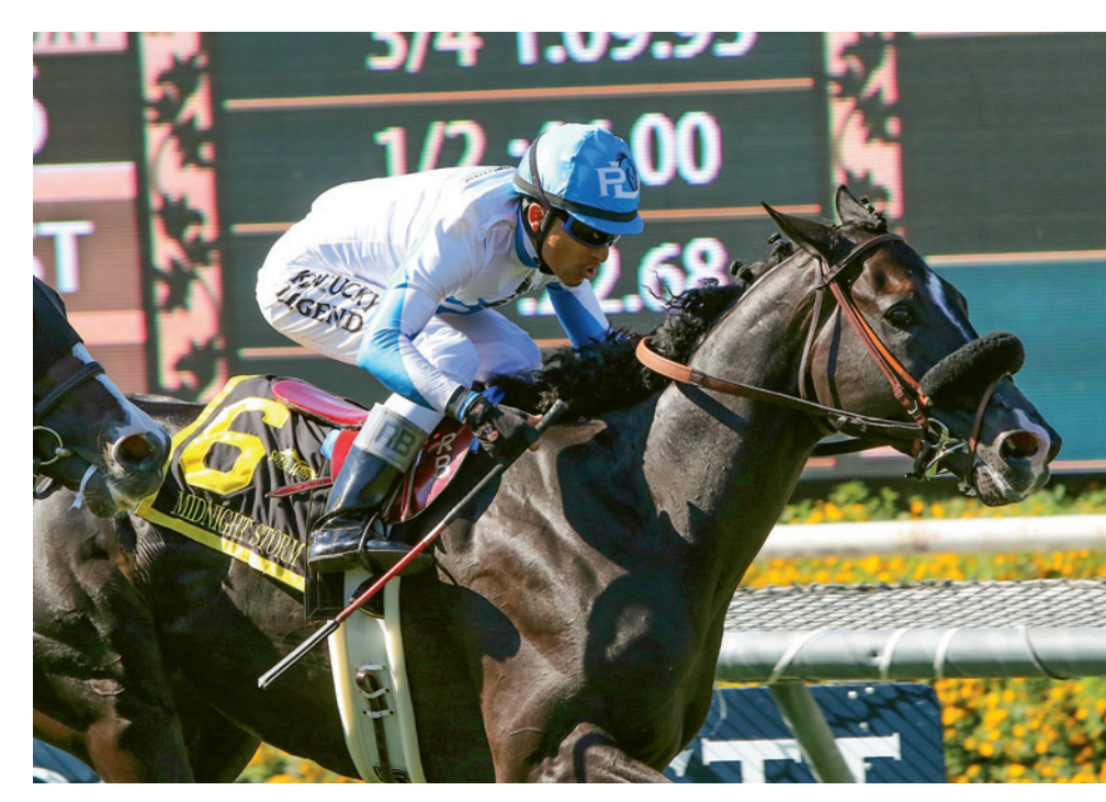
Midnight Storm earned a grade 1 win on the turf in the 2016 Shoemaker Mile Stakes at Santa Anita Park (above) but also captured multiple graded stakes wins on dirt, including the 2017 San Pasqual Stakes (below)