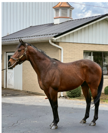
Grade 2 winner Air Strike entered stud in 2021 and stands for $2,000 this year

In keeping with that, the Duncans very much allow their horses to be horses despite bitter conditions that Ohio