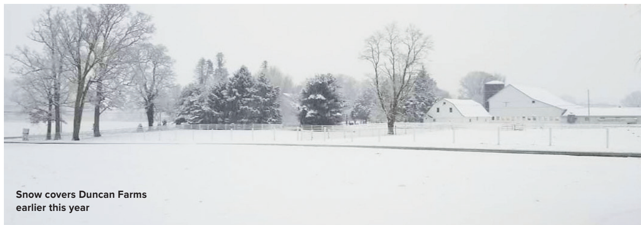
Snow covers Duncan Farms earlier this year