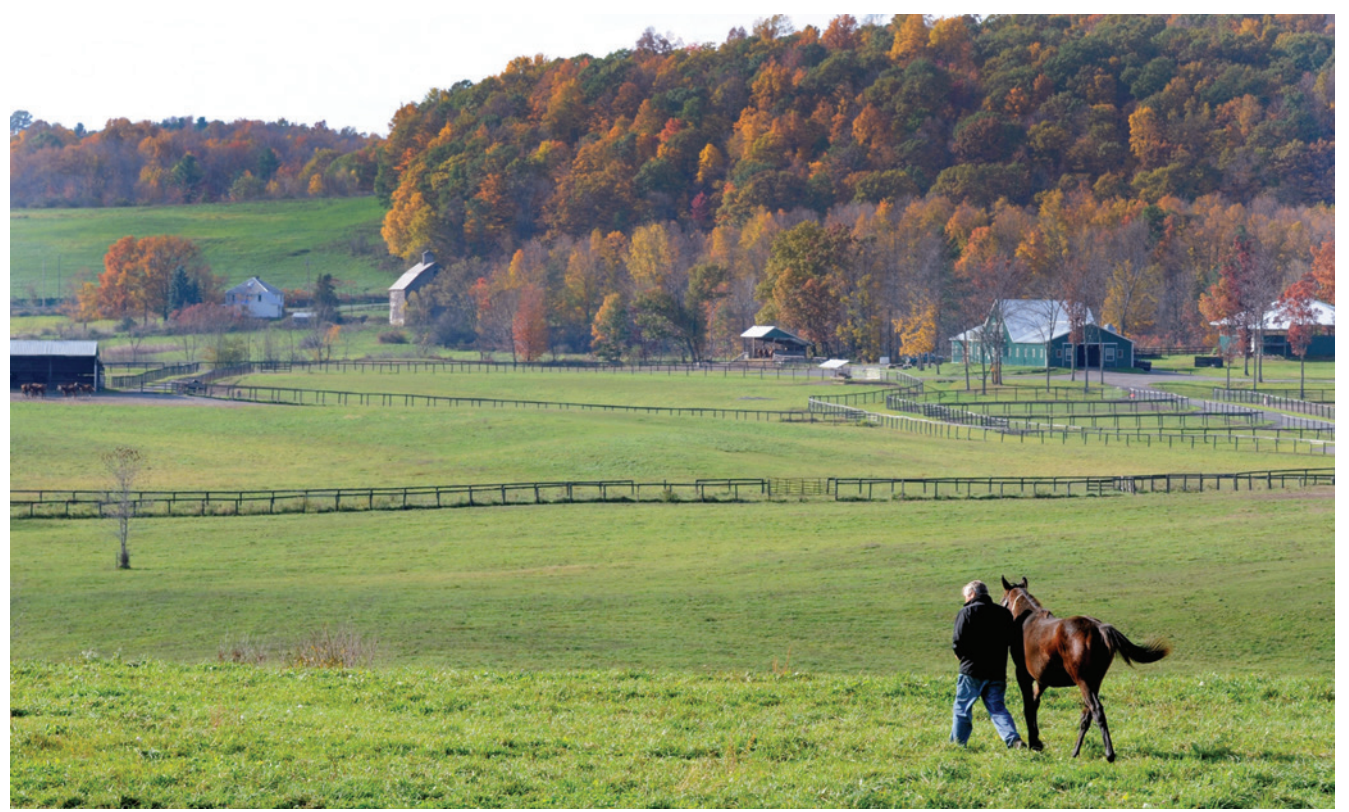
McMahon of Saratoga Thoroughbreds, five minutes from Saratoga Race Course, was founded in 1971. Its initial 100 acres grew with the addition of 140 acres bought by the McMahon family in 1994

In addition to eight wins, Solomini runners have placed second 13 times, leaving even McMahon a little