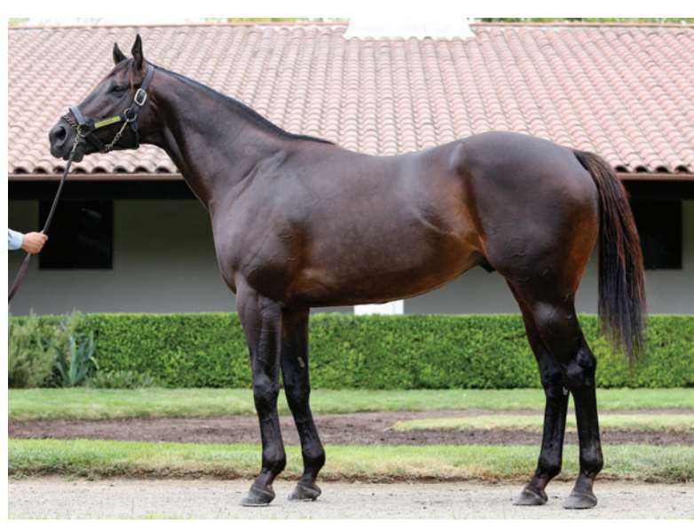
Virginia-bred Shaaz enters stud in 2024 at Barton Thoroughbreds with a listed fee of $5,000

$1.1 million 2-year-old—he is fabulous looking and has such poise and presence. He really is a classy horse."