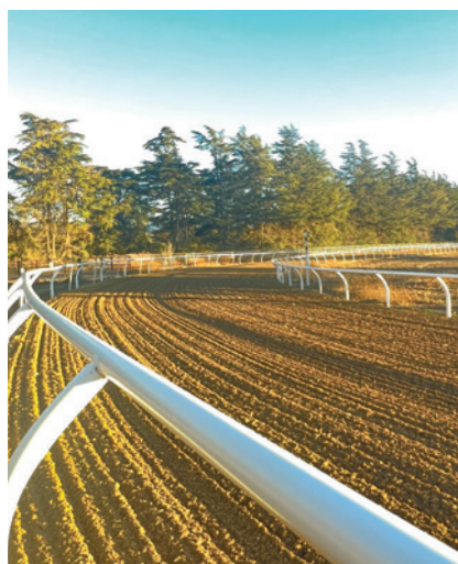
A new training track is one of the upgrades the Scullys have made to the property they lease

Eclipse Thoroughbred Farm consists of what was the central section of River Edge and includes the breeding facilities and major barns. The Scullys are adding to the amenities, having already built a training track. They are now working on a new breeding shed as part of their expansion from a lay-up, rehabilitation,