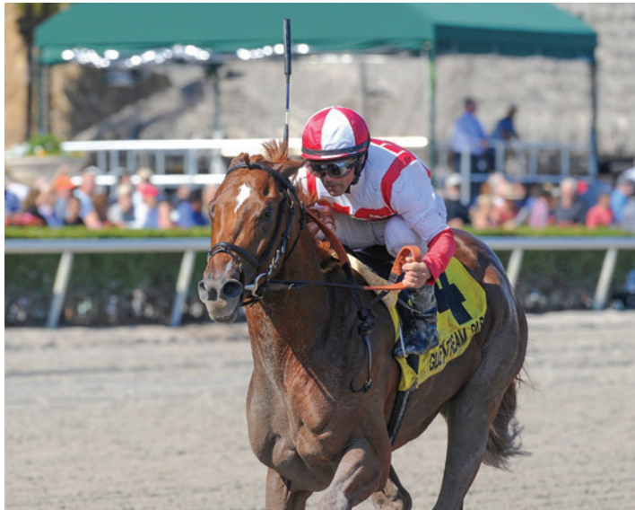
Favorable Outcome won the grade 2 Swale Stakes as part of his 28-race career, which yielded eight wins and $522,818 in earnings