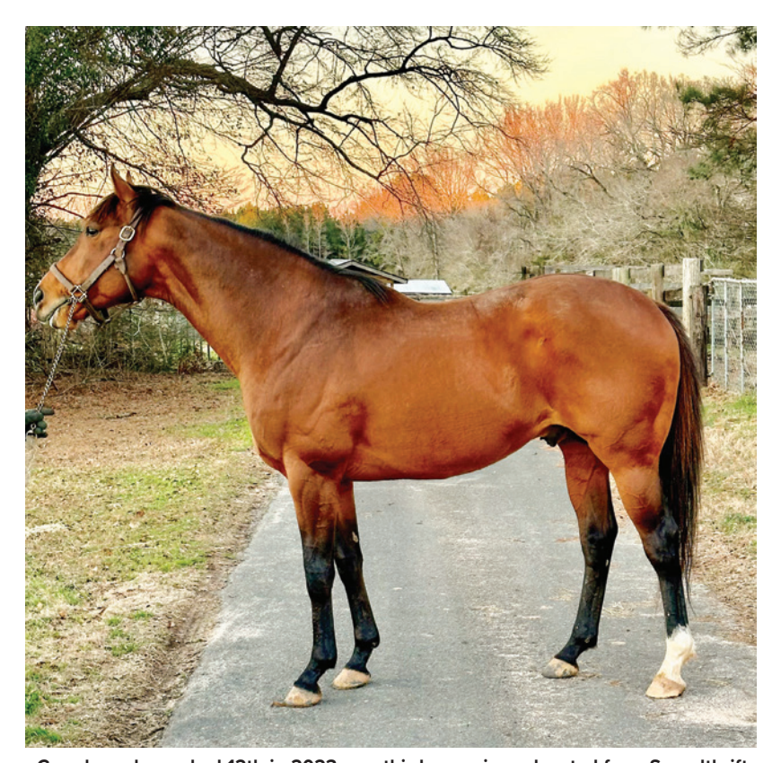
Gormley, who ranked 12th in 2023 as a third-crop sire, relocated from Spendthrift Farm in Kentucky to Red River Farms to stand the 2024 breeding season