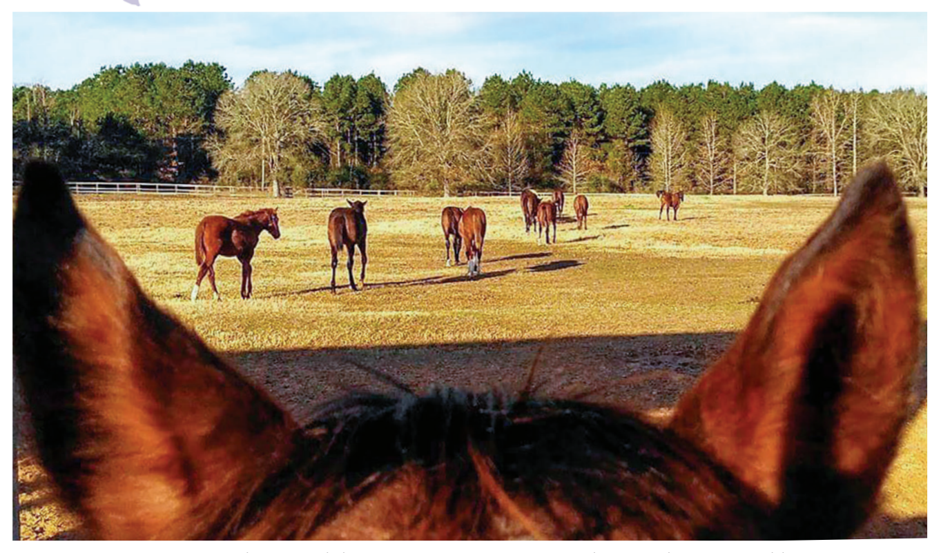
The Adcock family keeps building on the successful legacy of Red River Farms in northern Louisiana