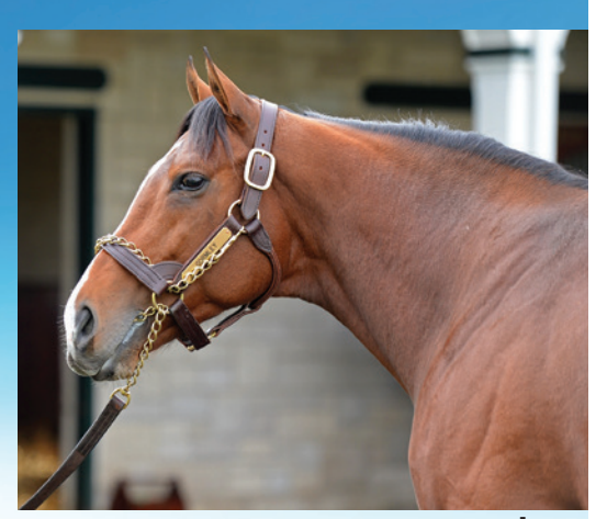
Gormley Race to Uran, by Rernstein

#2 stallion in Louisiana by progeny earnings