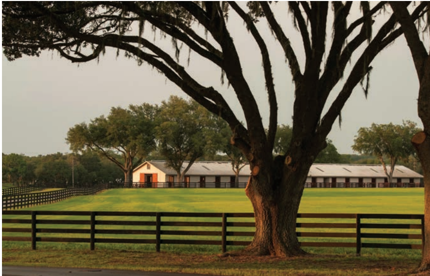
One of Kent's earliest jobs in Ocala was that of general manager for Appleton's Bridlewood Farm

* includes Southern Hemisphere foals; † Indicates a first-crop sire