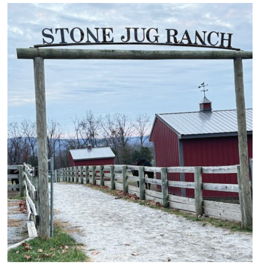
Stone Jug Ranch consists of two separate properties and, combined, they span 165 acres

Not only that, Tyson's sire has had great success with the family, including grade 2 winner Greatest Honour,