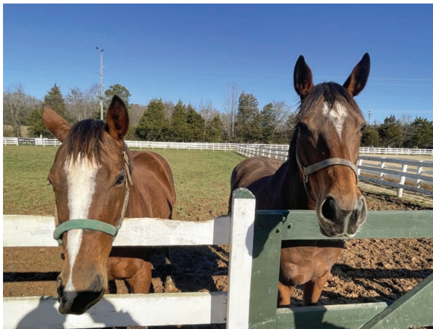
She's Stylish (left), the dam of Hartful Hope , is in foal to Endorsed whose first foals arrive in 2025. Girl On a Mission is in foal to Engage whose first crop will reach the races this year