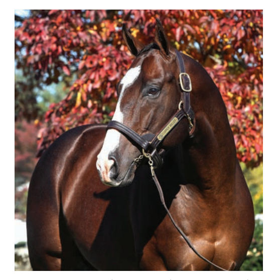
Copper Bullet previously stood in Kentucky and is new to the Texas stallion roster this year. The now 10-year-old son of More Than Ready ranked 10th in North America as a first-crop sire in 2023

"One of the things we were looking for was precocious speed but also versatility, and Creative Cause really encapsulates the versatility that Texas needs," said Clanin. "He can give you anything from a 2-year-old that can go 4½ furlongs to a graded stakes turf router. He ran in the Triple Crown