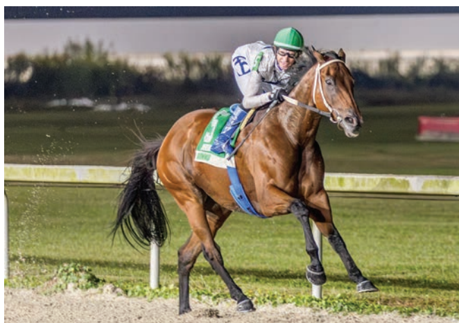
Bred by Coteau Grove Farms, graded stakes winner Touchuponastar has shined brightly on the racetrack, winning more than $1.5 million