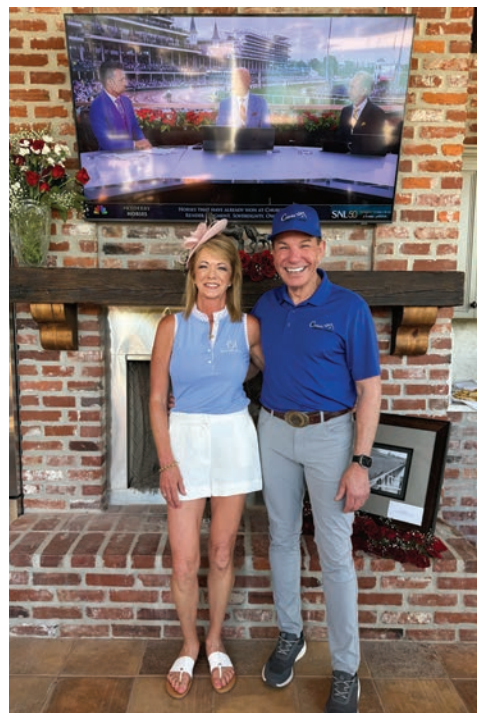
The profitable healthcare company launched by the Myerses in the 1990s paved the way for them to buy their farm

While some might dip their toes into racing by claiming a horse and breeding a single mare, the Myerses went all in from the very beginning.