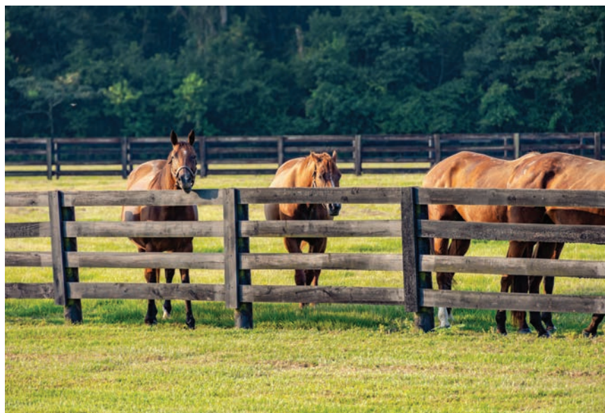
Acquiring quality broodmares is the cornerstone of the Myerses' operation

Of course, every horse bred by the Myerses didn't go on to become a stakes winner, but that early success reinforced their business model and convinced them they were on the right track.