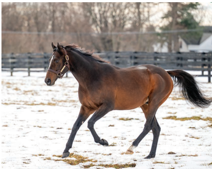
Another Mountain View Farm resident is Fire At Will, the 2020 Breeders' Cup Juvenile Turf winner