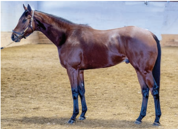
Incoming sire Mo Plex, a multiple graded stakes winner and grade 1-placed performer, is standing at one of the newest breeding enterprises in New York, Mountain View Farm near Gansevoort, for a fee of $2,500

The initiative announced by NYRA in December accelerated the implementation of the increases; rather than being executed in two phases, the roll-out of additional monies for horses of all ages will take place this year. Details and specific purse amounts will be published in the first condition book for this summer's Saratoga Race Course meeting. "Raising purses for New York-breds has been a conversation piece for many years; it predates my time here," said