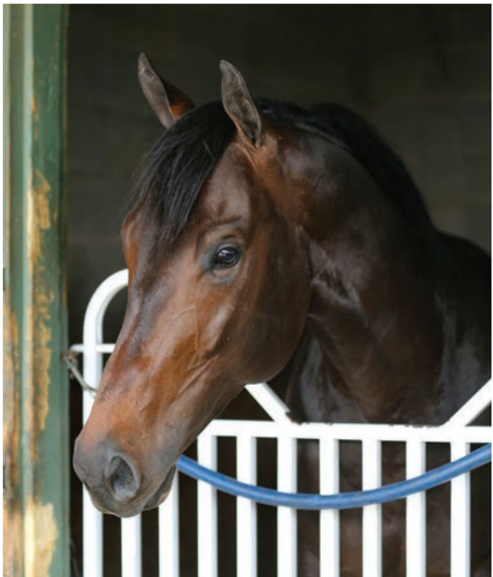
Warrior's Charge, a graded stakes winner for Ten Strike Racing and Madaket Stables, stands at Irish Hill & Dutchess Views Stallions for a fee of $5,000 and will be represented by his first crop of 2-year-olds this year