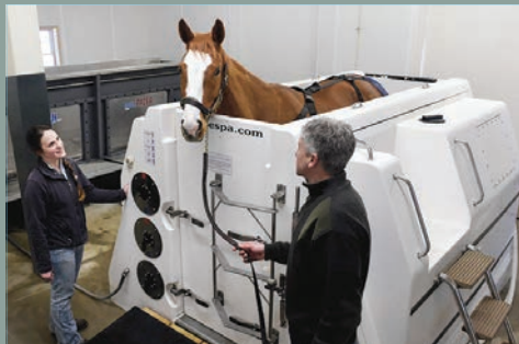
ECB COLD SALTWATER SPA

Post-surgical care. Lameness work-ups. Diagnostic imaging. Shockwave therapy. Pre-conditioning.