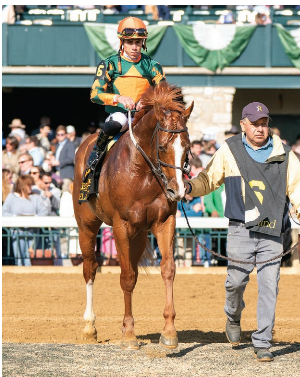
Another new face in the stallion ranks is Amsterdam Two Farm's Arzak, currently the only son of Not This Time standing in New York