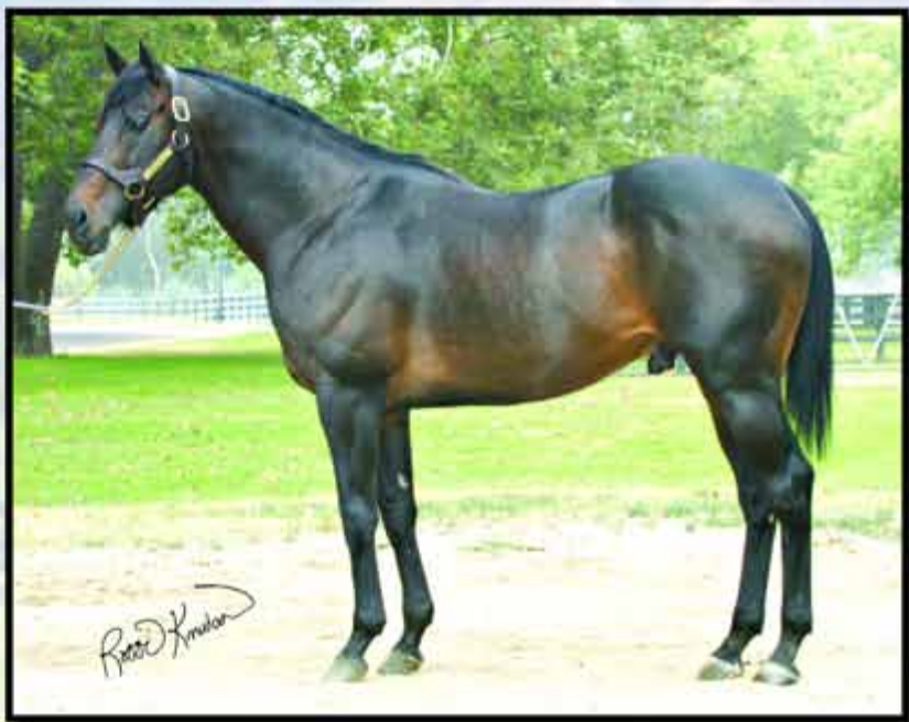
Siberian Express – Kantado, by Saulingo 2010 Fee: $12,500