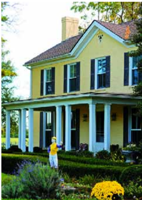
The main residence at Chestnut Farm was built in 1843

"The next stakes in California was going to be $100,000, and here were $500,000 and $750,000 stakes back there," House said.