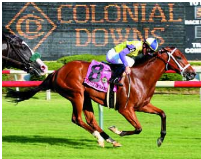
Battle of Hastings wins under the Houses' purple-and-yellow silks