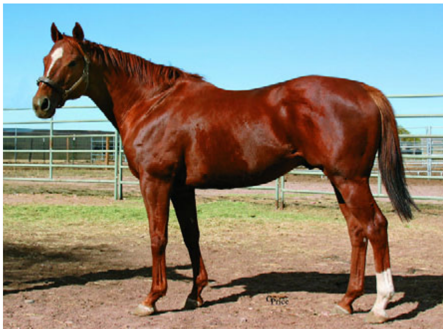
Dominique's Cat, by Storm Cat, joined the farm's roster in 2005

K.O. Punch (Two Punch—Joanie's Princess, by Joanie's Chief) first stood at McKenna Thoroughbreds in 2006. Runners from his first New Mexico-bred crop are 2-year-olds and include Mean Jean, a first-