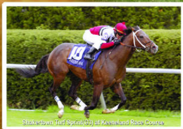
Shakertown Turf Sprint(G3) at Keeneland Race Course

"He ran a 20 & change 1/4 in the Breeders' Cup Turf Sprint (G1)."