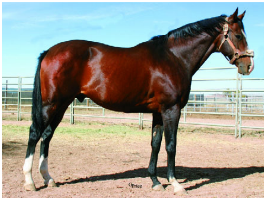
K.O. Punch, a son of Two Punch, moved from Kentucky in 2006

"We don't break our horses at the track. We've got a cowboy here, and he breaks horses the cowboy way. We use a western saddle and a snaffle bit. We don't try to put a rein on them like you would a performance horse. He rides them in the open country and gets them to respond to the rein, where you can put a saddle on them