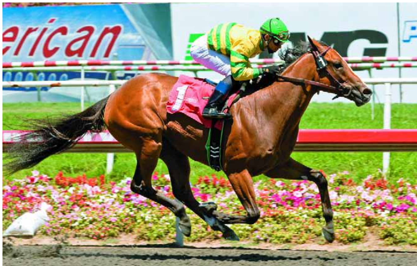
BENOIT &amp; ASSOCIATES