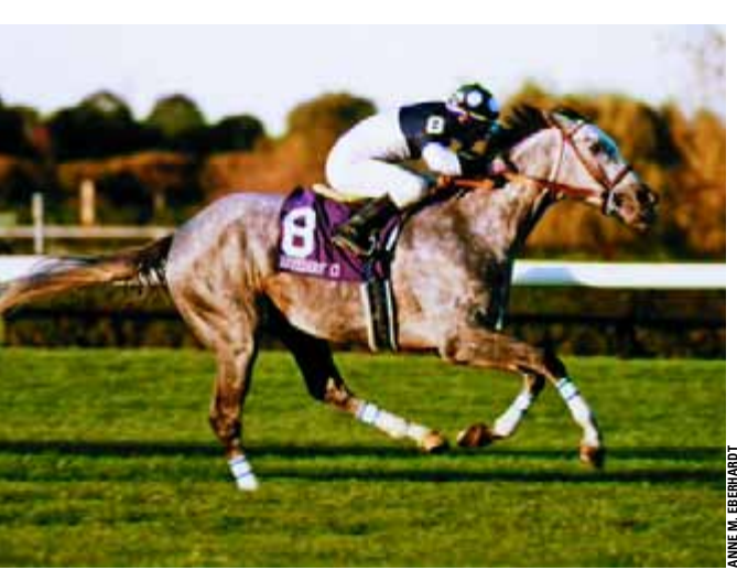
Kinghaven Farms' With Approval, the first of two Triple Crown winners