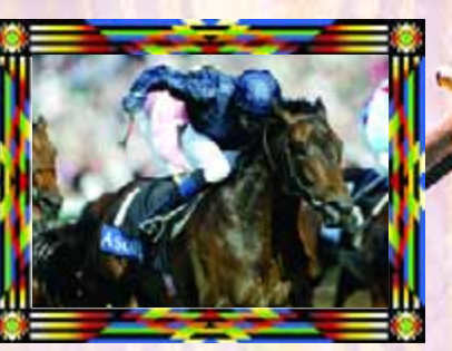
Seattle Slew - Statuette, by Pancho Villa 2010 Fee: $5,000 Canadian Funds Live Foal • Stand & Nurses • Multiple Mare Discount Nominated to Breeders' Cup & Ontario Sire Stakes

Ironically, the troubles of Woodbine and racing contradicted the rise of Kinghaven Farms, which won back-to-back Canadian Triple Crowns with With Approval (1989) and Izvestia (1990) and produced dozens of champions and stakes horses.