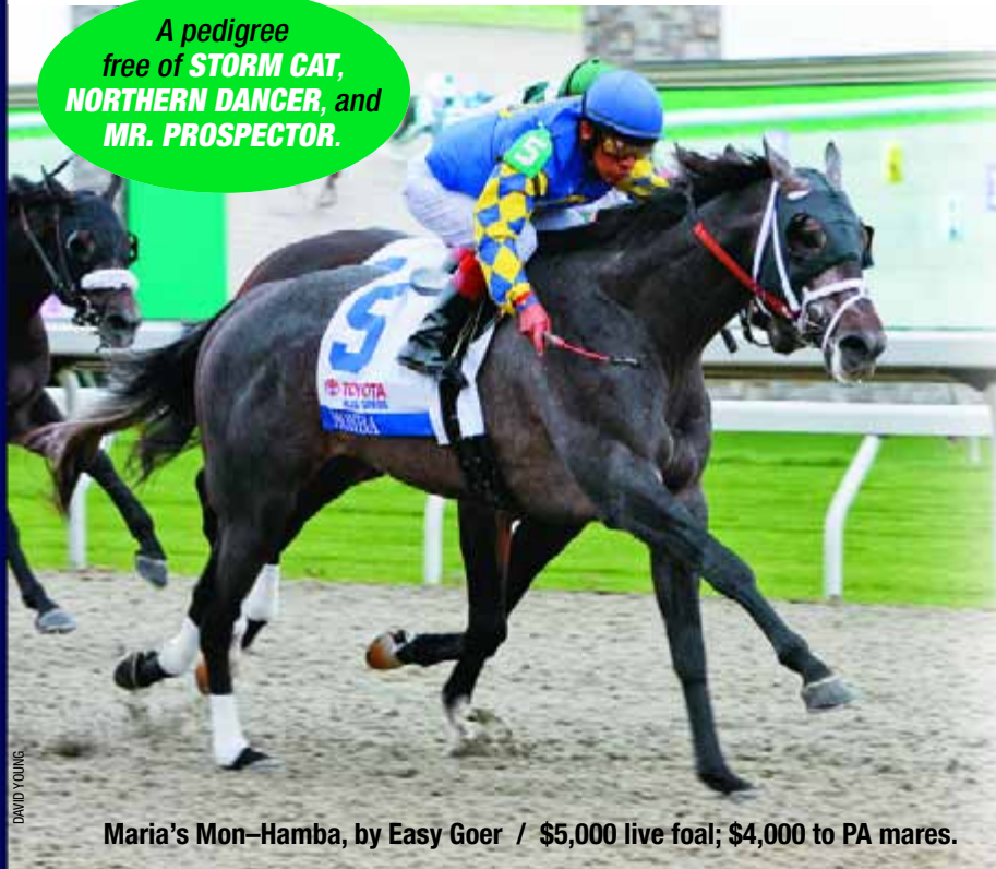
Maria's Mon-Hamba, by Easy Goer / $5,000 live foal; $4,000 to PA mares.

A pedigree free of STORM CAT, NORTHERN DANCER, and MR. PROSPECTOR.