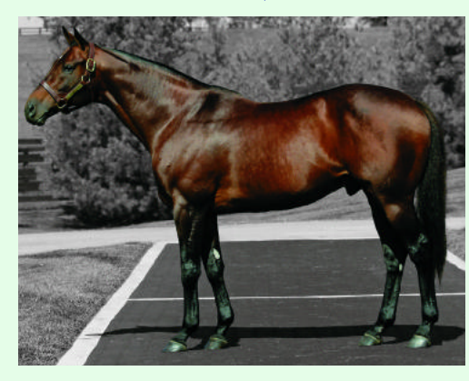
Quiet American – Really Blue, by Believe It

Sire of more than 30 Stakes Horses including Champion MIDNIGHT LUTE, the only two-time winner of the Breeders' Cup Sprint-G1. Already sire of 2010 SW ANYTHING BUT QUIET ($241,811), winner of the $60,000 Happy Ticket S. on Jan. 16. Among Pennsylvania's Leading Sires since 2005 and Co-Leader by SWs in 2010! $50,712 Average Earnings per Runner