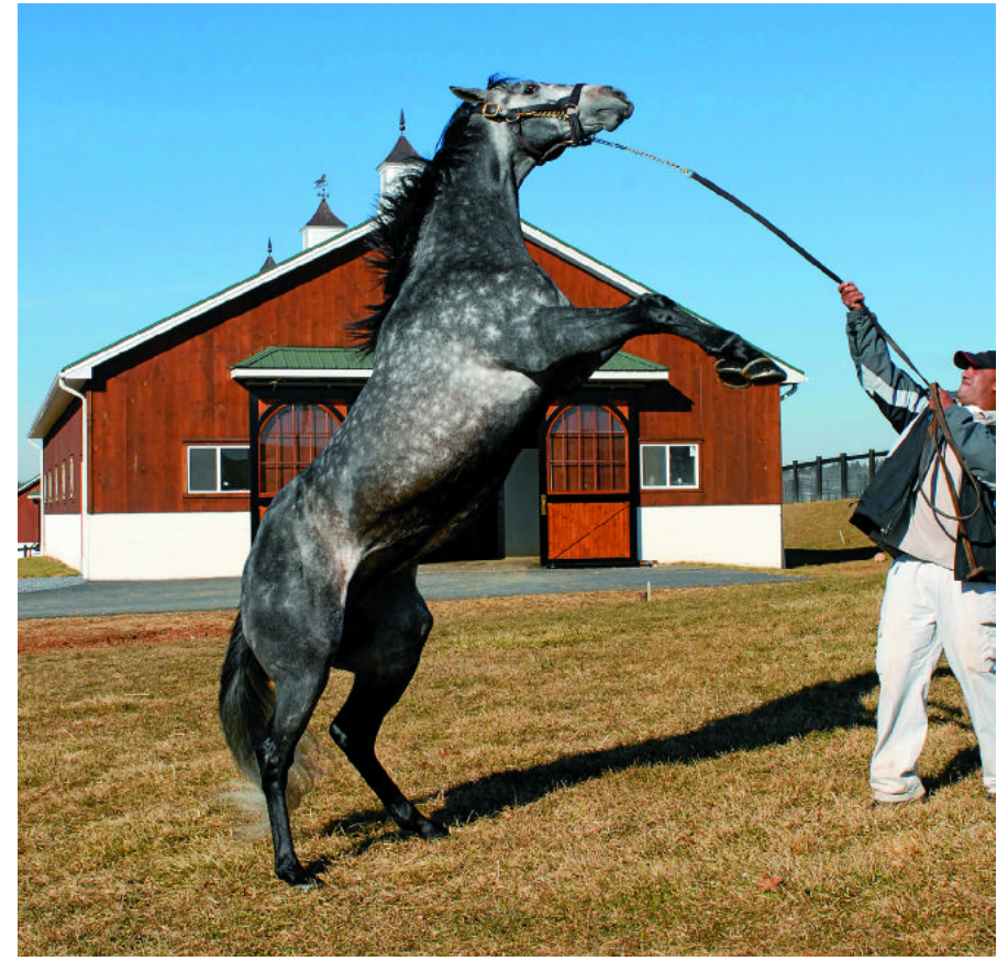
New for 2010 is Blue Grass Stakes winner Monba

"This township's been great," he said. "I showed them my plans, and within a few minutes I was ready to get started. I'm very lucky in that respect. And the community has been great, too. People just show up and ask, 'Do you really have a Kentucky Derby winner here?' There hasn't been one thing that really jumps out as a roadblock that I had to overcome; it's been fairly smooth. I've been blessed with having