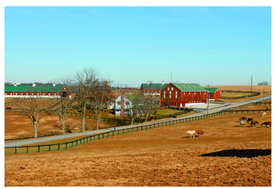
Five grade I winners will stand this year at scenic Penn Ridge near Harrisburg