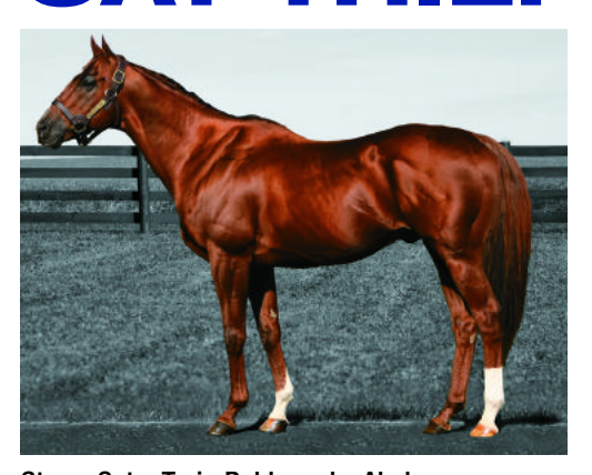
Storm Cat – Train Robbery, by Alydar 2010 FEE: $5,000 LIVE FOAL (due when foal stands and nurses; special consideration to PA-foaling mares)