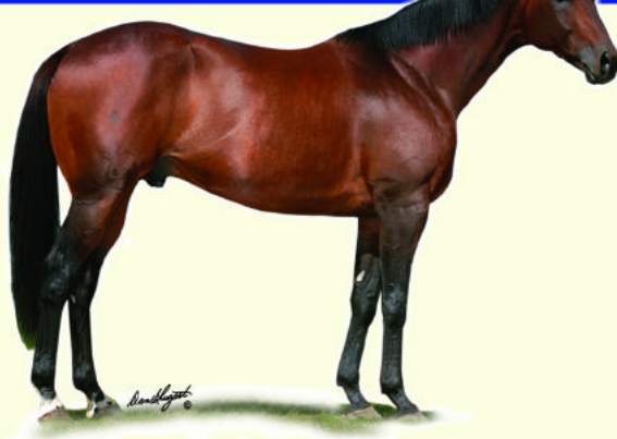
2010 Fees: Private Nom. to Breeders' Cup and N. M.-Bred Program and Lineage

Acneas Capote-Gone to Venus, by Gone West