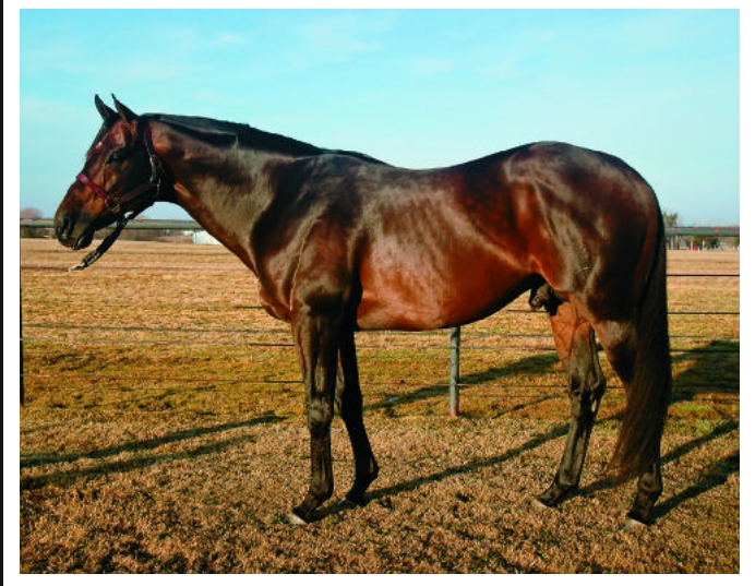
Liquor Cabinet covered 57 Thoroughbred mares last breeding season

The other current stallions are Diamond (Mr. Prospector-