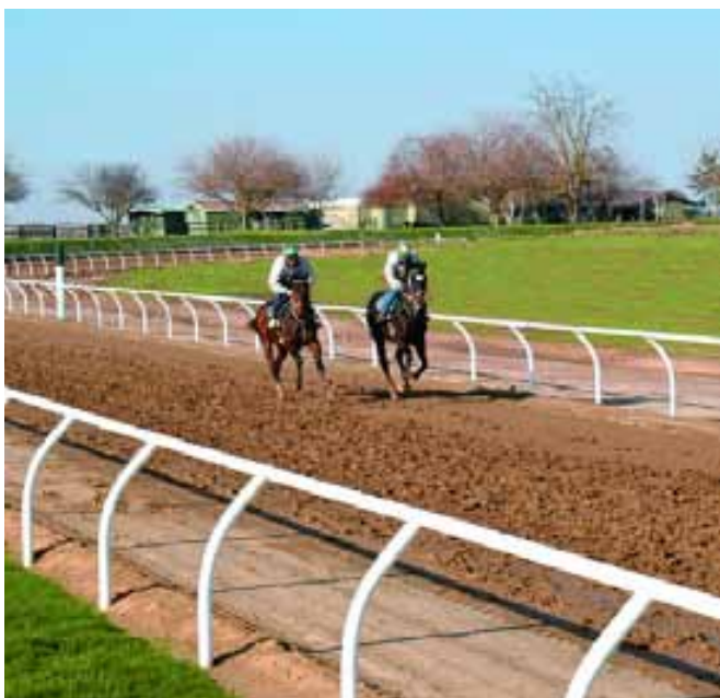
The five-furlong training track helps ready 2-year-olds for the races

Griswold even set a bit of cross-breed history when he com-