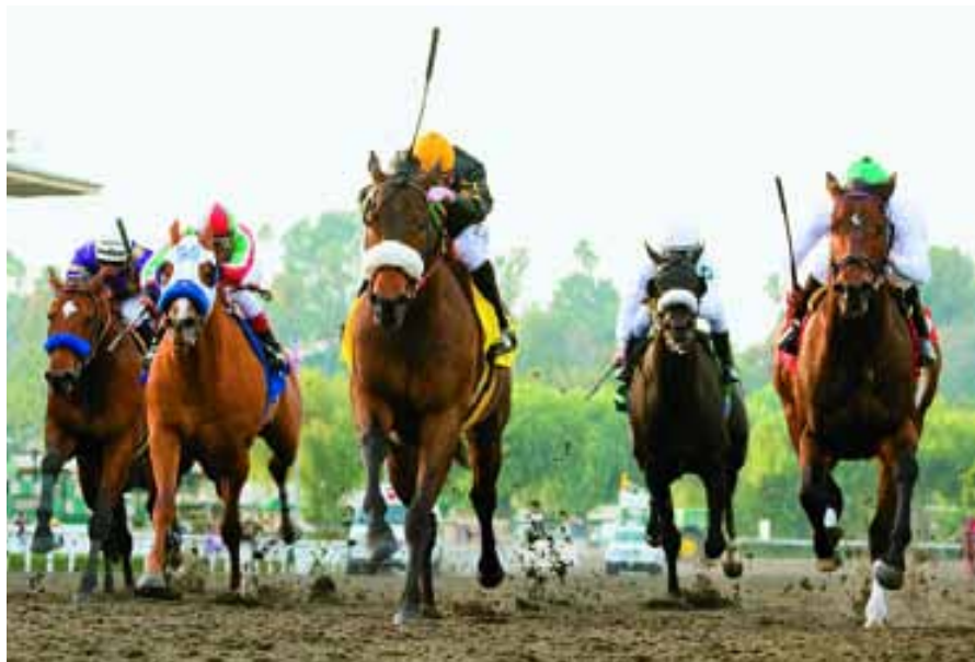
Papa Clem, shown winning the San Fernando, will be the newest stallion at Legacy Ranch