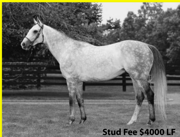
Stud Fee $4000 LF

ROUSILLON - CITY FORTRESS by TROY MG1SW, $1,581,165