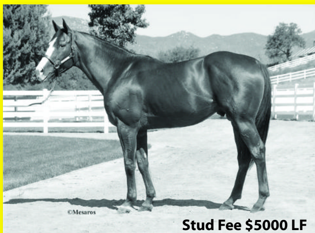
Stud Fee $5000 LF

MARCO BAY - LIFE LASS by SENECA JONES G1SW, $1,428,141