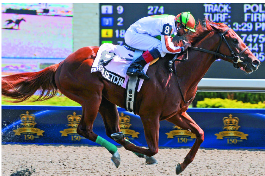
Olredlgetcha wins the Victoria Stakes at Woodbine