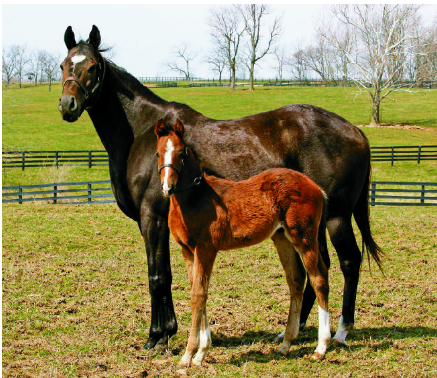
Kimchi and her colt by Unbridled's Song at Taylor Made Farm; she was bred to Street Cry