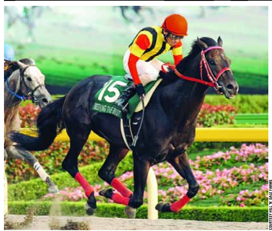
Seeking the Best, whose first foals are yearlings, has moved to Colebrook Farms

*A-E and COMPARABLE INDEX: The lifetime Average-Earnings Index indicates how much purse money the progeny of one sire has earned, on the average, in relation to the average earnings of all runners in the same years; average earnings of all runners in any year is represented by an index of 1.00. The Comparable Index indicates the average earnings of progeny produced from mares bred to one sire, when these same mares were bred to other sires. Only 32% of all sires have a lifetime AEI higher than their mares Comparable Index.