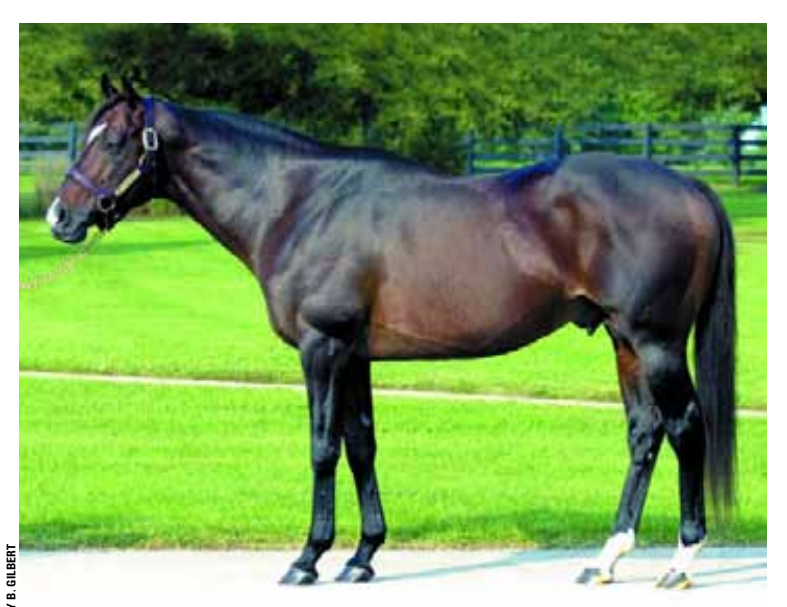
Swain has moved from Shadwell Farm in Kentucky to Ascot Stud

With such strong support for stallion owners, it would not be a surprise to see the Ontario stallion market continue to grow.