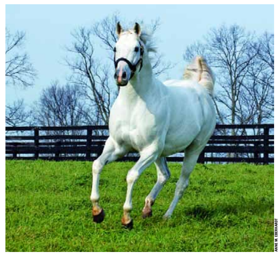
Alphabet Soup, one of a group of Adena Springs stallions now standing at Gardiner Farms

The Ontario region has also been a prolific breeding ground for broodmares, including stakes winners and producers Glorious Song, the dam of leading sires Rahy and Sing-